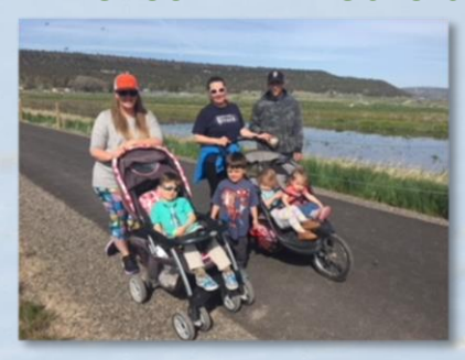
BRING YOUR STUDENTS